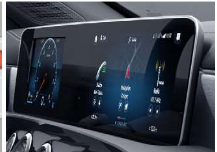
MBUX multimedia system with DAB digital radio and "Hey Mercedes"