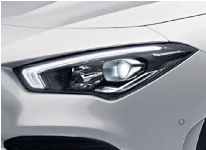
LED High Performance headlamps