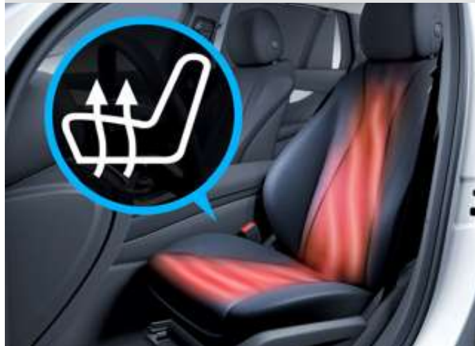
Heated front seats