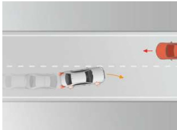
Active Lane Keeping Assist, Speed Limit Assist and Active Brake Assist