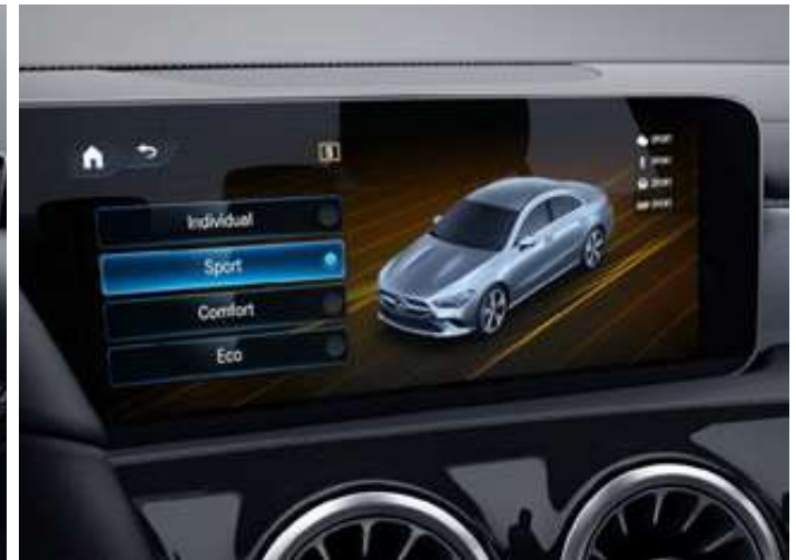
10.25-inch media touchscreen