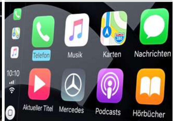
Smartphone integration with compatible phones and wireless charging