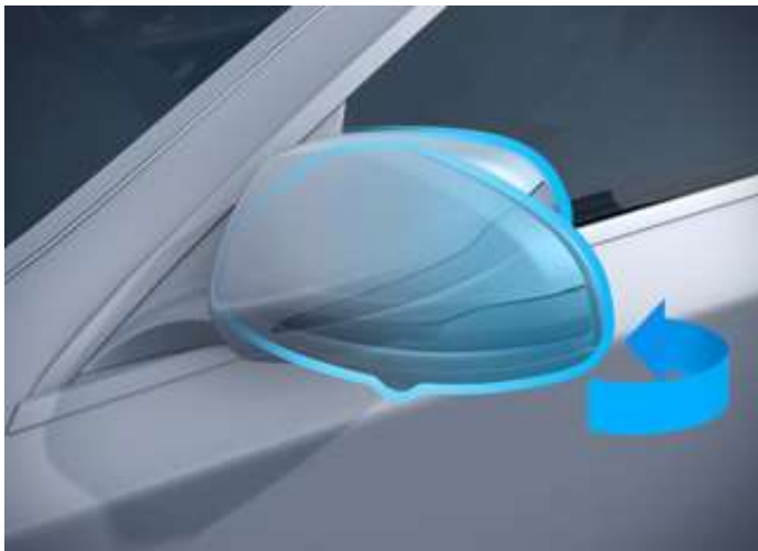
Mirror package including electrically-folding exterior mirrors