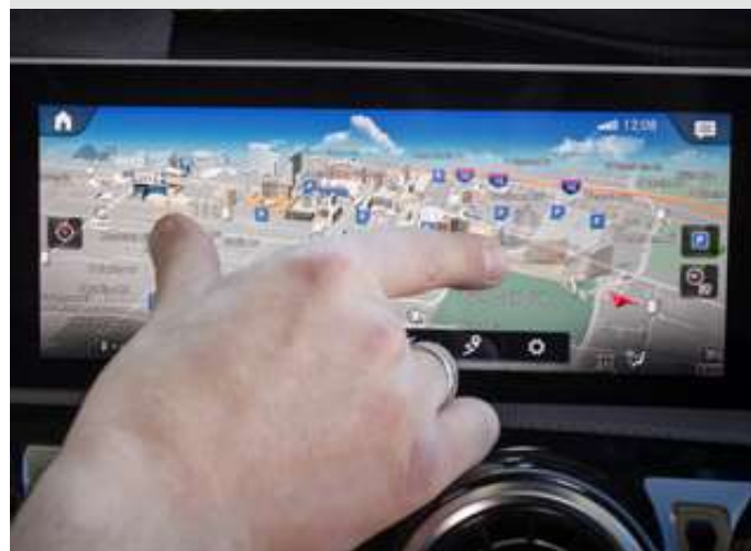
Hard-disk navigation with three years free live traffic information